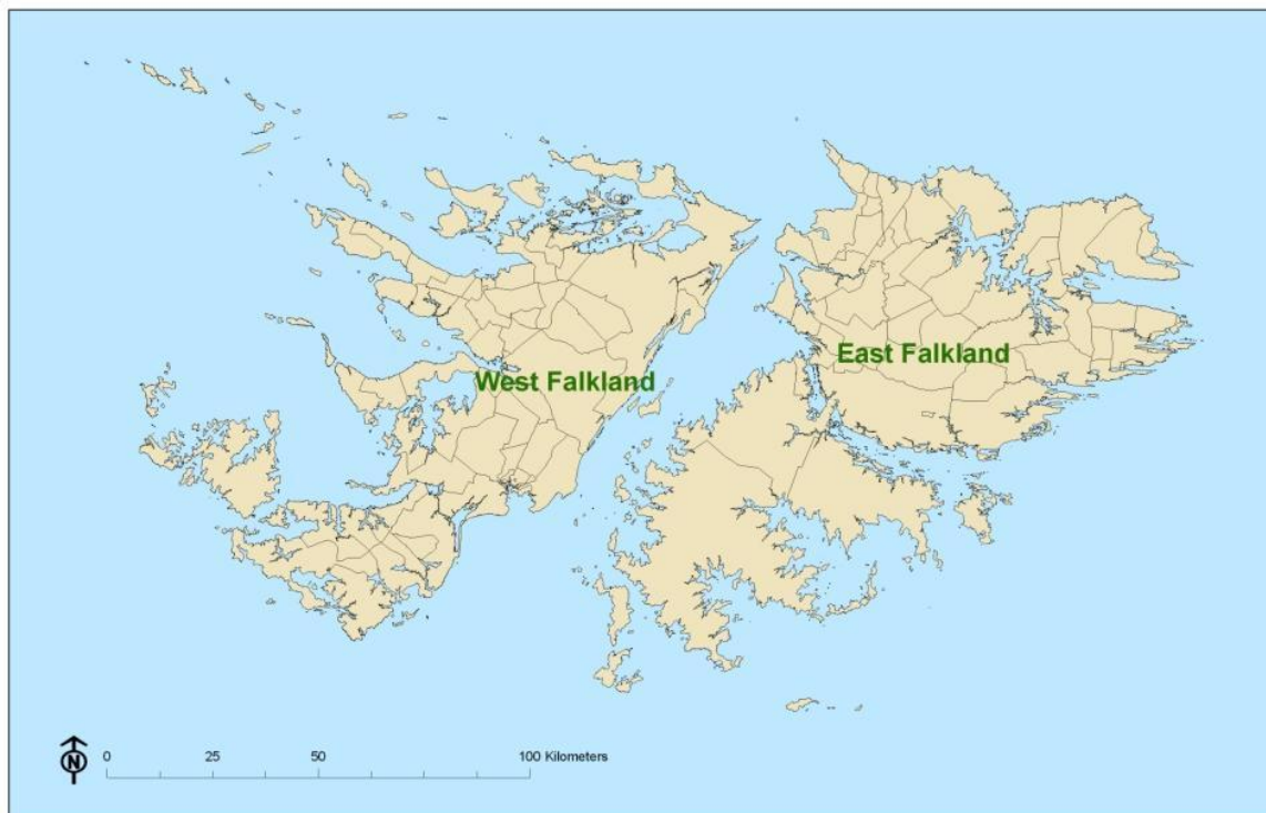
Figure 1. A map of the Falkland Islands

To date some progress has been made towards tackling the problem of erosion and restoring areas by planting tillers of tussock ( Poa flabellata ) or blue grass ( Poa alopecurus ) on eroded or recently cleared coastal sites. However this technique is extremely labour intensive and limited to establishing a single species on a single substrate. In addition to the recognised threats to key conservation sites and agriculture, activities such as minefield clearance, the removal of invasive species and the construction of infrastructure for the oil industry are set to create further disturbance to habitats. Research is therefore urgently needed into techniques for halting the erosion on a variety of different substrate types, ranging from recently exposed peat to bare clay patches resulting from many years of erosion. The Challenge Fund project is the first step in addressing this important knowledge and implementation gap.